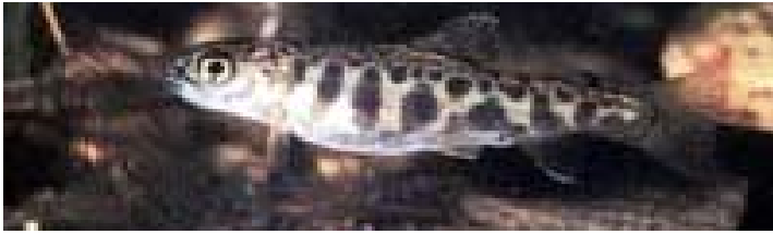
A. Juvenile steelhead