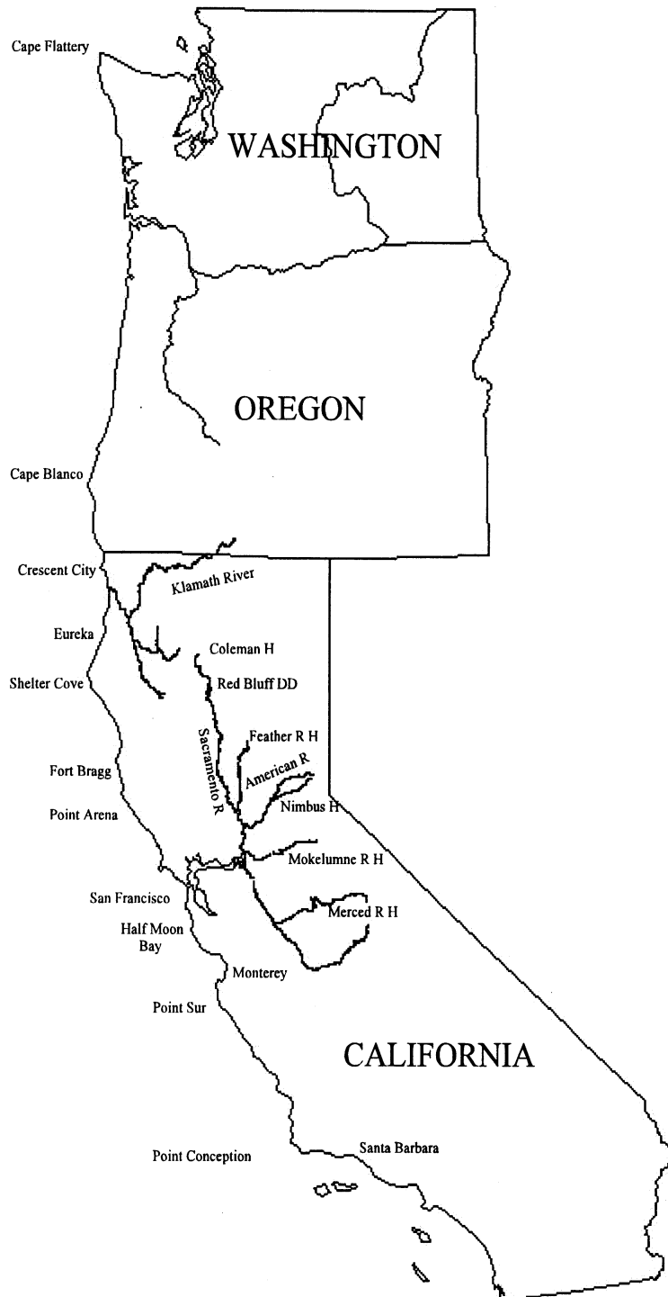
Figure 1 Map of coastal landmarks and Central Valley streams and hatchery locations